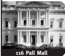
116 Pall Mall